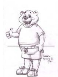
"Elbe": Park Mascot