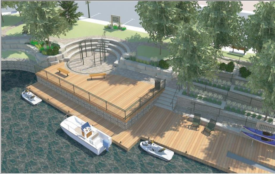
Option 2 – Overhead View 1

The Delta Community Improvement Committee has worked on a planning report, town website ( https://www.deltaontario.com ) and development of Millside Park in the center of town. "Small boats will be able to dock on the new stabilized docking that will include a canoe and kayak launch." According to the Winter 2021 letter from Mayor Hoogenboom, sent with the interim tax bills, phase 2 of the project has been completed. Details about the project can be found at https://bit.ly/3oWCzL4 . Below is an artist's rendering and an actual photo!