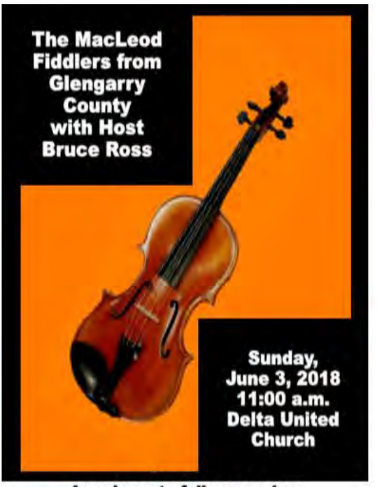
Luncheon to follow service All Welcome!

Old Town Hall, 8 Lower Beverley Park Road, Delta. All are welcome!