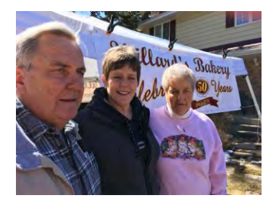
to all of the volunteers, sponsors, vendors, attendees and partner organizations who helped make the 51<sup>st</sup> Anniversary celebrations another great success. /