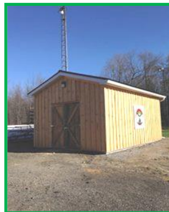
Photo: New Storage Building