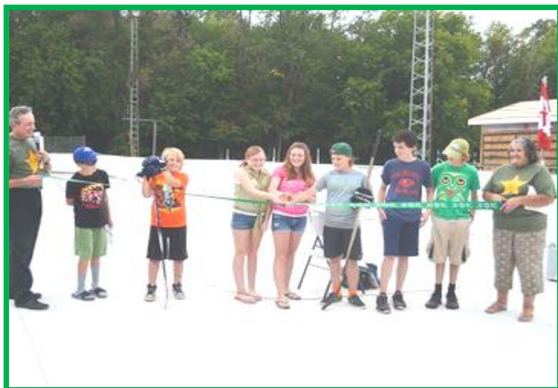
Photo: Ribbon Cutting Ceremony on September 19 th

Major changes occurred in 2015 with the grand opening of the new concrete rink surface, the construction of a new storage shed, the installation of new metal roofing on the Recreation Centre and the relocation of the water system inside the Centre. As soon as weather permits, lines will be painted on the rink surface for a tennis court and new basketball nets will be installed.